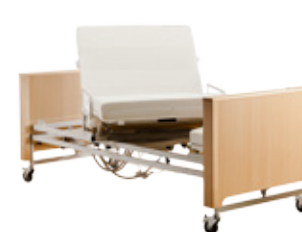
3. Turn of the LS by 45°