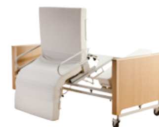
6. Rising position