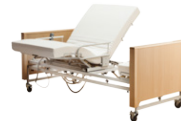
4. Turn of the LS by 90°