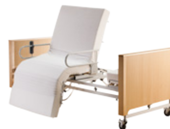
5. Sitting position