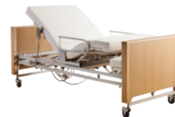
2. Head and foot part adjustment