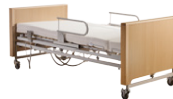
1. Lying position