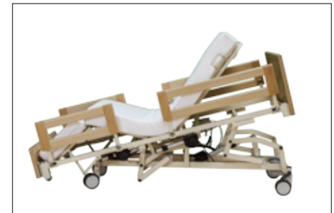
Sitting and nursing position