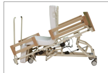
Sitting and exit position