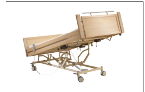
Lowering head end (Anti-Trendelenburg)