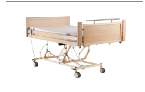
Raising the lying surface