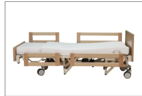
Lowering the lying surface/lying position