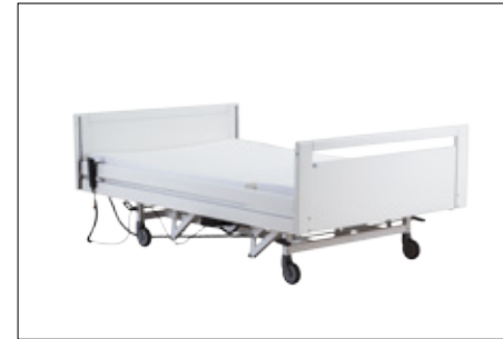
Setting the lying surface low