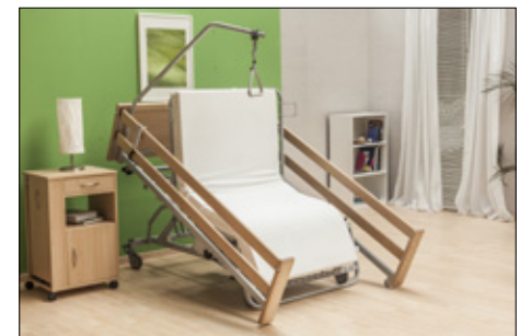
forza aktiv mit durchgehenden Seitengittern