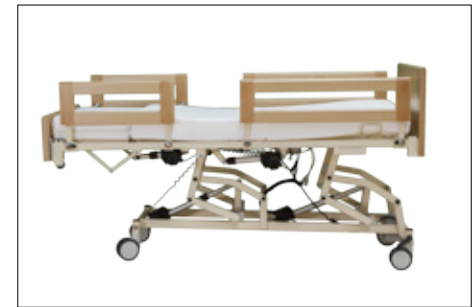
Raising the lying surface