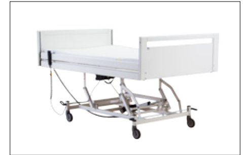
Raising the lying surface