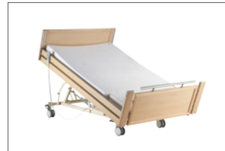
Lowering foot end (Trendelenburg)