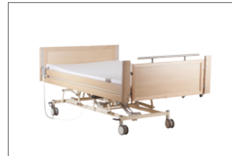
Lowering the lying surface