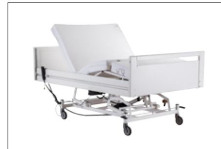
Head and foot section adjustment