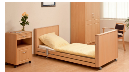
Lowest Position 13cm