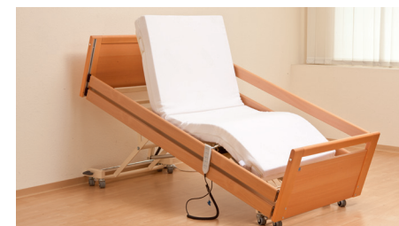
Max. adjustment of lying surface