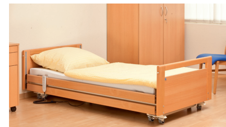
Lowest Position 20cm