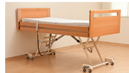
Highest Position 80cm