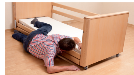
No injury risk when rolling out of bed