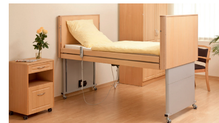
Highest Position 80cm